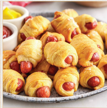
Pigs in a Blanket