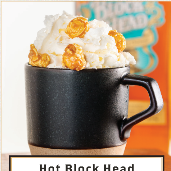
Hot Block Head