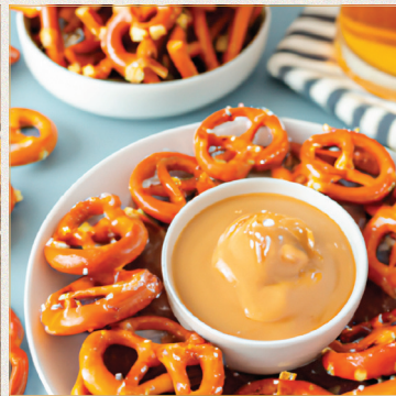
Pretzels W/ Cream Cheese Caramel Whiskey Dip