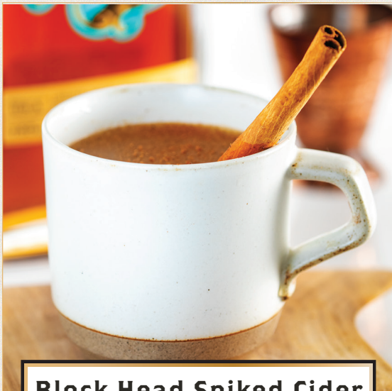
Block Head Spiked Cider